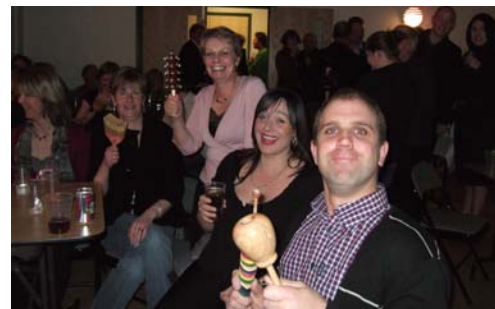
Dom & Co with their maracas!

Please read the attached notice carefully and return the cut-off slip with you time sheet as soon as possible. The note contains important information about company policies that affect everyone .